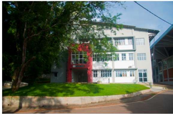
The UMCSAWM Premises, University of Moratuwa (above) and the unique learning experience at UMCSAWM based on in-class and field activities (below)