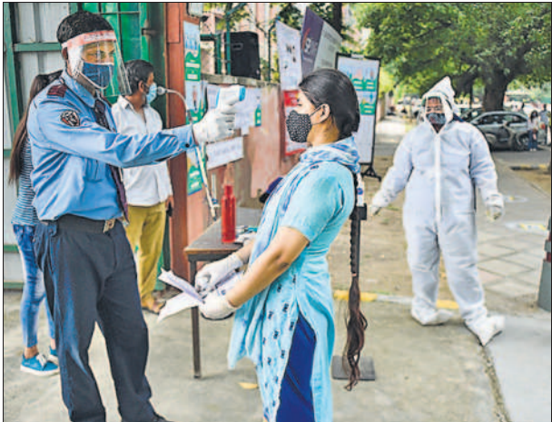
A candidate undergoes thermal screening as she arrives at a NEET examination centre, in New Delhi in September 2020.

The NEET-PG postponement came three days ahead of the scheduled exam date amid rising coronavirus cases in the country. "In light of the surge in #COVID19 cases, GoI (Government of India) has decided to postpone NEETPG2021 exam, which was earlier scheduled to be held on April 18. Next date to be decided later," health minister Harsh Vardhan tweeted on Thursday.