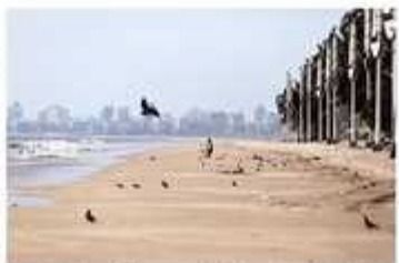
One with nature: A life guard patrols a deserted Juhu beach after COVID-19 curbs were enforced on Thursday.