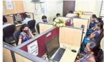
Helpline to the rescue: Staff at the new COVID-19 helpline 1912 that has been opened in Bengaluru.

Karnataka reported its sharpest spike of 14,738 fresh cases and 66 fatalities, bringing total infections to 11,09 lakh and the toll to 13,112 on Thursday.