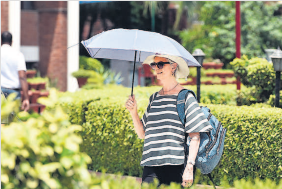
A day after the Delhi witnessed dusty winds and drizzle under the influence of a western disturbance, the maximum temperature in the city dropped to 38.7 degrees Celsius from Thursday's 39.4°C, the Met department said. It also forecast partly cloudy conditions for the next 24 hours.